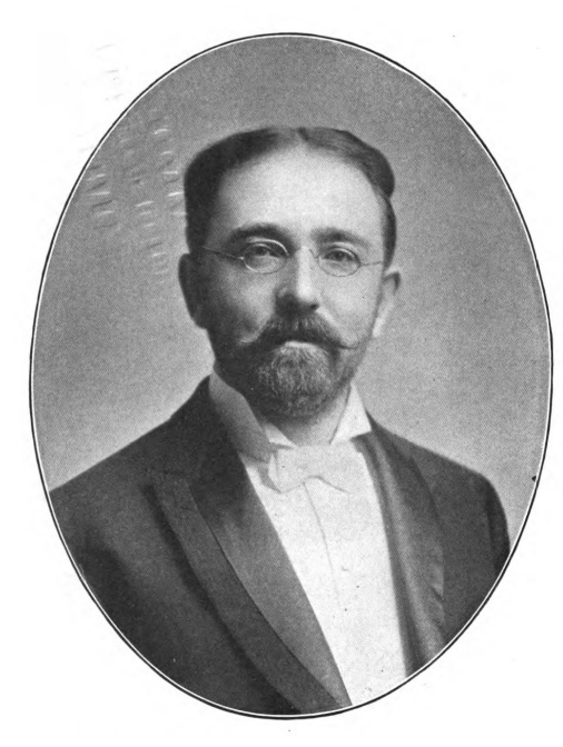
S. W. Staads, from Wegweiser zur Gesundheit, 1905

"Law of minimum dose"—the notion that the lower the dose