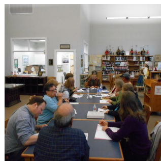
Teaching a Czech class at the TCHCC in La Grange, Spring 2014

Our website is currently at http://sites.utexas.edu/txczech . Our permanent website, coming later this fall, will allow users to search through the transcribed segments by the age and gender of the speaker, location, and other criteria. Our efforts this year will concentrate on improving the site's searchability and continued transcriptions to enrich the Dialect Archive.