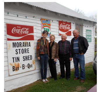
The TCLP in Moravia, TX