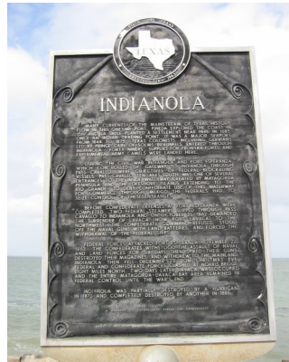
Many German immigrants came through Indianola

First, there has to be substantial involvement from a significant number of community members who are passionate about reviving a dying dialect or language. In Wales, the grass roots effort of the 1960s and 1970s to revive Welsh was a widespread phenomenon, supported by a great number of Welsh people of different generations whose pride in their culture and language inspired them to participate in its revival. While most Texas German speakers that we interviewed over the past 13 years are typically very proud to speak the language, most of them are less willing to actively engage in any language revitalization efforts, such as teaching the dialect to preschool and school children. (Such an engagement would involve several hours of daily classroom instruction and activities, a commitment that most Texas German speakers do not feel comfortable making.) Community involvement across several generations is one of the central pillars of suc-