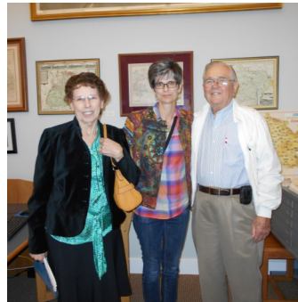
After an interview with TX Czech speakers