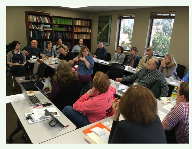
Participants of the TGDP Educational Outreach Event

On January 14, 2017, the TGDP invited twenty four educators and professionals to the Germanic Studies Department at the University of Texas at Austin to discuss ways to promote Texas German Heritage in Texas The TGDP schools. staff invited educators and professionals to this meeting because K-16