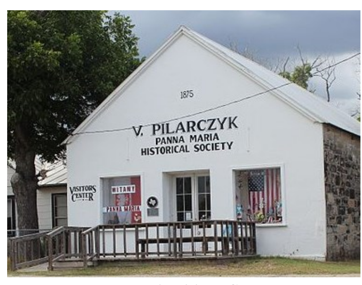
Panna Maria Visitors Center

wilderness of an unknown climate was an extreme challenge. Nonetheless, they began to farm early on, providing themselves both sustenance and income, and some found work as labor-