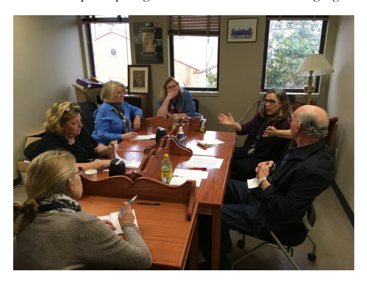
Participants brainstorming teaching ideas

the outreach event stressed the need to conform these lesson plans to the guidelines of the American Council on the Teaching of Foreign Languages (ACTFL), the Common European Framework of Reference for Languages