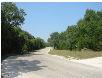
On the way to conducting an interview in the Hill Country

provide an opportunity to educate the public about a proud yet unsung culture. From print to wireless, the TGDP has had its fair share of press coverage in the last ten years. It was featured in more than fifteen newspapers across Texas, the L.A. times,