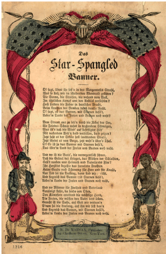
The Star-Spangled Banner in German (19th century)