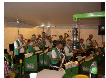
Texas German music is likely to be passed on to future generations