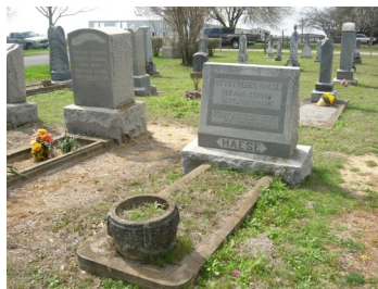
Texas German tombstones are likely to be preserved in the future

Until the advent of Internet technology, an internationally-accessible digital audio archive