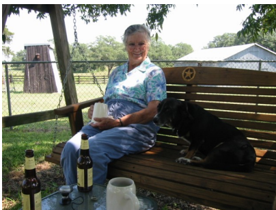
Recording of an oral history interview in Freyburg, TX

Crack open a typical public school history textbook, and you will notice that German immigrants to Texas are merely mentioned in passing. Visit the Texas History Museum in Austin, and you will find one small text about German immigrants; nothing more. Many college students at UT Austin are shocked when they learn that German, Czech, Swedish, and Norwegian immigrants were instrumental in shaping 19 th century Texas. It is no wonder that Texas students and the general public know very