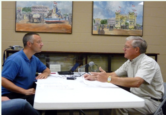
Interview with a Texas German speaker in May 2010