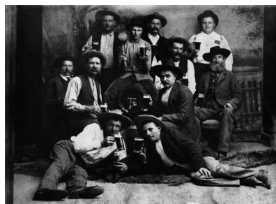
Texas Germans having a good time in the 1870s.

Crack open a typical public school history textbook, and you will notice that German immigrants to Texas are merely mentioned in passing. Visit the Texas History Museum in Austin, and you will find one small text about German immigrants; nothing more. Many college students at UT Austin are shocked when they learn that German, Czech, Swedish, and Norwegian immigrants were instrumental in shaping 19 th century Texas. It is no wonder that Texas students and the general public know very