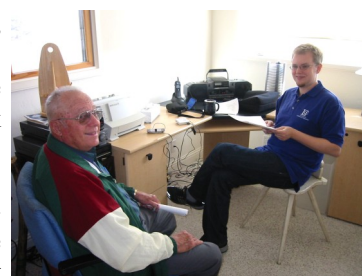
Interview in Doss

ranging from childhood games to current activities. Since we want people to feel comfortable during the recording, we ask them about their favorite topics. Interviewers record the session, because data analyzers are interested in many aspects of the community's language, not just in hearing one or two unusual pronunciations or a new word. It is not possible to listen for all the different features simultaneously without creating a recording that researchers can go back and listen to as many times as necessary. One of the TGDP's main goals is to paint as accurate a picture of the history, culture, and language of Texas Germans as possible; the recordings help us ensure that the descriptions we develop are based on real-life language use