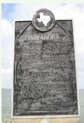
Historic Marker in Indianola commemorating the arrival of German immigrants