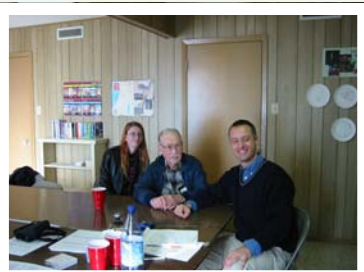
Interview with a Texas German speaker