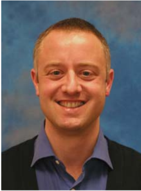
Hans C. Boas, Ph.D.

One misperception about Texas German is that it is “bad” German. From a linguist’s point of view, there is no such thing as a “good” or a “bad” dialect. Instead, each dialect is its own regular communication system that adheres to internal rules and regularities. The common prejudices against dialects can often be attributed to socio-political or historical causes. Texas German is not only a systematic and rule-governed dialect, it is also different from other dialects in that it has borrowed many words from English. Such