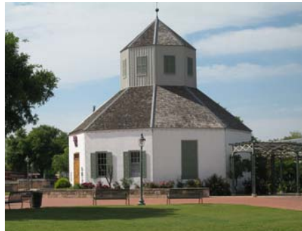
The Vereinskirche Museum in Fredericksburg, Texas

TGDP has been unable to receive further external grants for the past 15 months, drastically reducing the TGDP's ability to record and archive interviews.