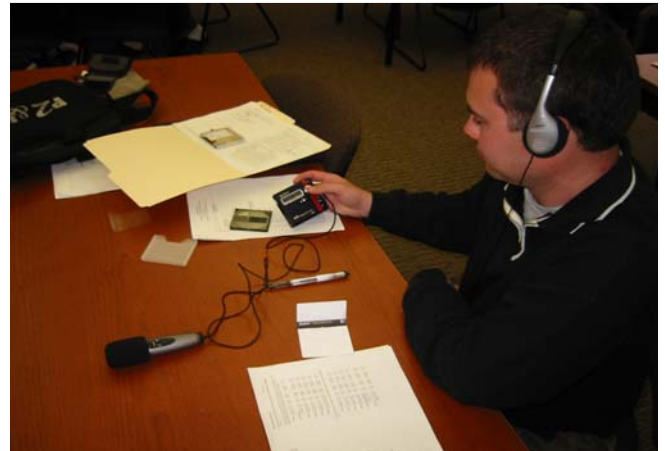
Heritage preservation in action

distinction. Texas Germans have retained and preserved the best of German traditions and values. The whole world, and perhaps