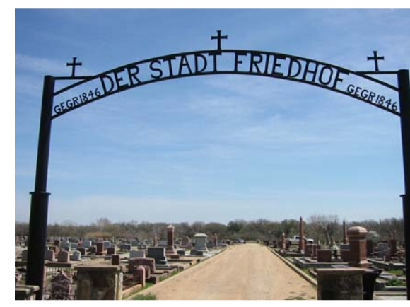
Cemetery in Fredericksburg

registered yet, you are asked to provide a user identification (e.g., your name), and a password of your choice. After registration, you can use your user identification and password to log into the archive for free. By clicking “Enter Archive” you have to agree to the terms of use displayed on the next page. Then, you are taken to a new page containing a map of Texas with an area marked in red. Click on the red area and you will see the names of the locations where we have conducted interviews with Texas German speakers. Clicking on a location opens a new window containing a list of all available interviews for that location. Clicking on the title of an interview, e.g., “German Christmas”, will open a new window containing the transcription of the interview as well as an English translation. As you read the transcription and translation you can listen to the actual recording of the interview on your computer.