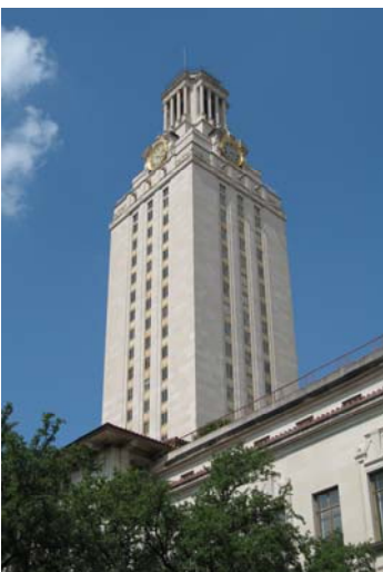
The University of Texas tower

THE UNIVERSITY OF TEXAS OFFERS A VARIETY OF COURSES DEALING WITH TEXAS GERMAN, TEACHING STUDENTS THEIR HISTORY AND HOW TO CONDUCT FIELD INTERVIEWS .